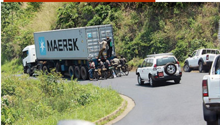
Driving in Bujumbura requires a lot of attention: Some people on bicycles hung on a trailer as others climb so as to get up the hills and home.

With Covid-19, HOPE program continues except that meeting students in groups is no longer possible. The government has not yet decreed confinement, or has not yet banned gatherings, but as HOPE, we have taken steps to protect children and protect ourselves.