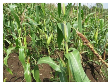
Farming of maize