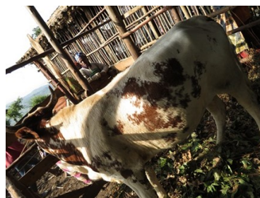
A cow that is being reared by the group