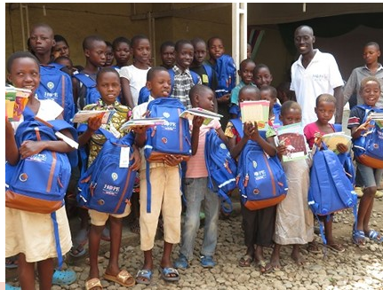
Primary students receiving school materials

The month of September is still a nightmare for majority of Burundian parents and students following the reopening of schools for a new school year. Few of them have sufficient school materials required by the school. When the school opened, the students of BurundiKids program were very happy to be able to go with all the necessary equipment. Despite the socio-economic situation of their families, they go to school with confidence knowing that they will not be expelled from school due to the lack or delay in paying of school fees.